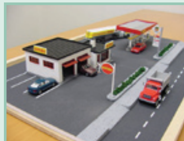
Model of SONLUBE facility