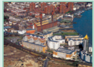
A Brownfields development example: Chelsea Harbor project in London