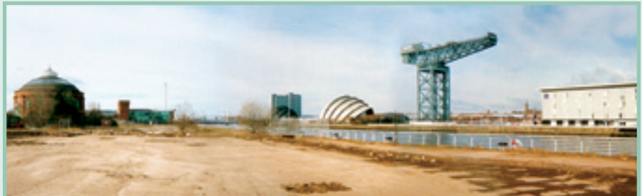
Glasgow: Upper Clydeside redevelopment