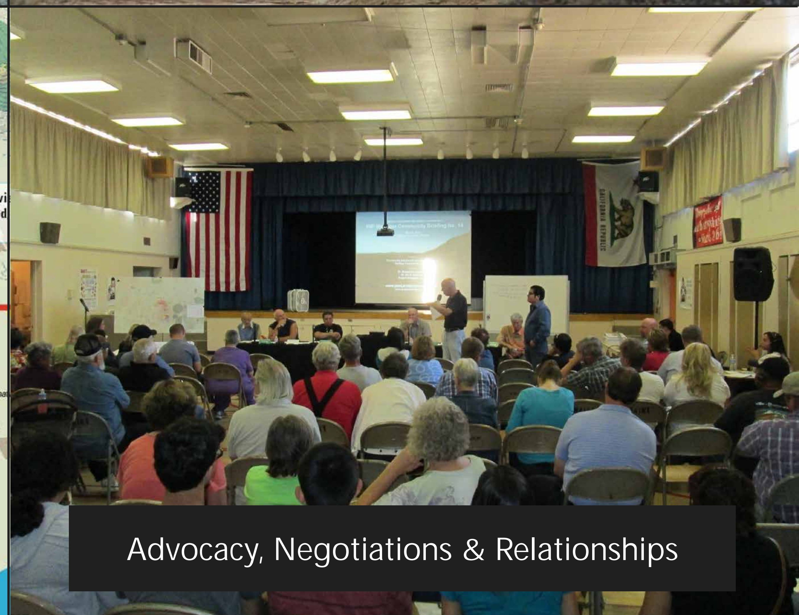
Advocacy, Negotiations & Relationships