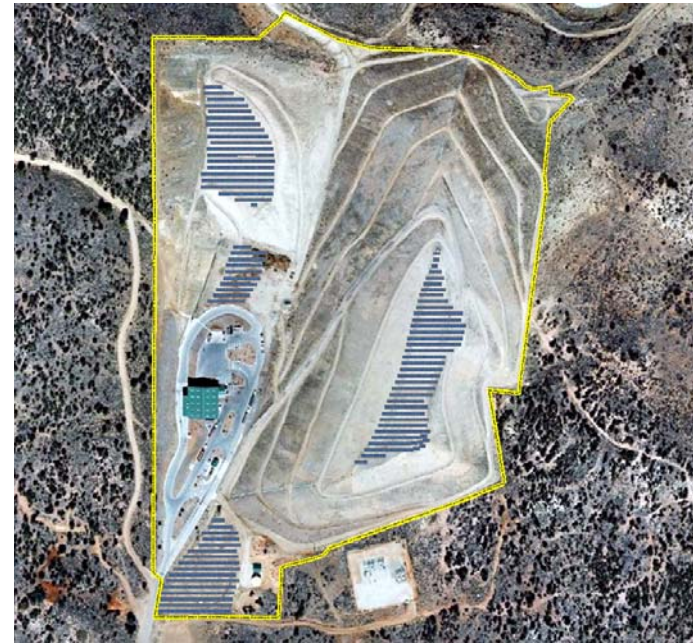
Solar panels would be located on the top deck of the Big Bear Sanitary Landfill and on selected flat areas near the base of the waste prism.