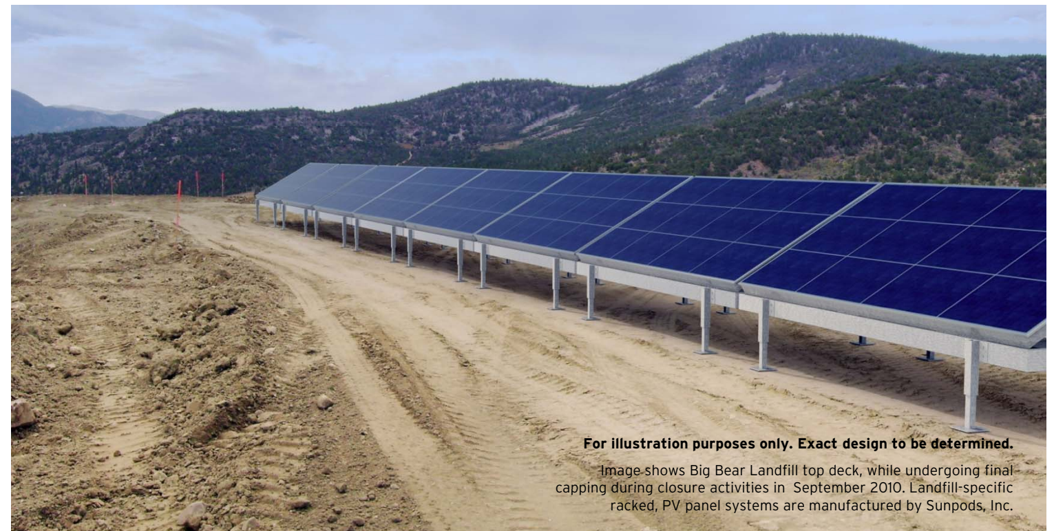
For illustration purposes only. Exact design to be determined.

2MW PV SOLAR DEVELOPMENT, BIG BEAR, CALIFORNIA