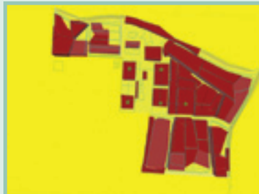
MAR Services Impacted Media