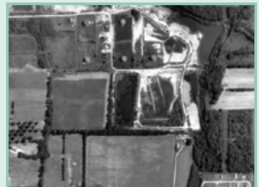
MAR Services Aerial