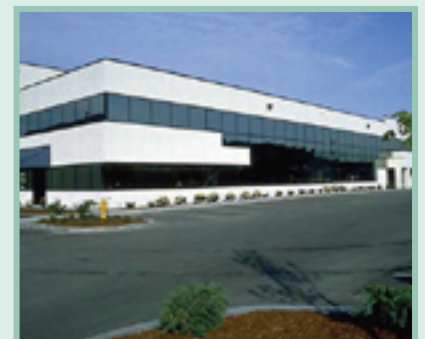
Our work has included commercial real estate transactions