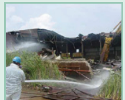
Tex Tin Superfund Site, Texas City, Texas