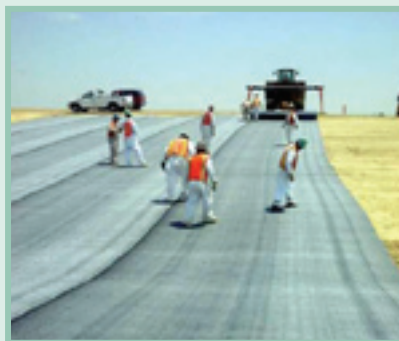
Operating Industries, Inc. Superfund Site, Monterey Park, California